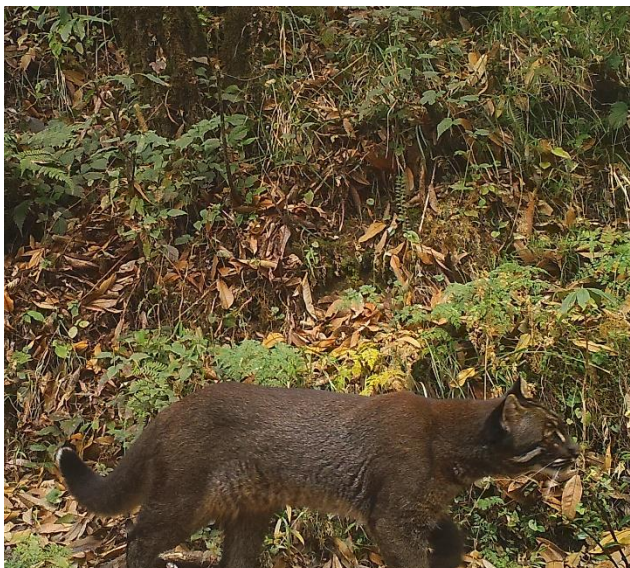
PHOTO 1: Asiatic golden cat, grey morph camera trapped in TMJ area.

Asiatic golden cat Catopuma temminckii is one of the eight species of small cats found in Nepal. It is an extremely rare felid species for Nepal and has been photographed only once before in 2009 at Makalu-Barun National Park. A single image of a grey morph of this species was photographed in TMJ during the survey (PHOTO 1).