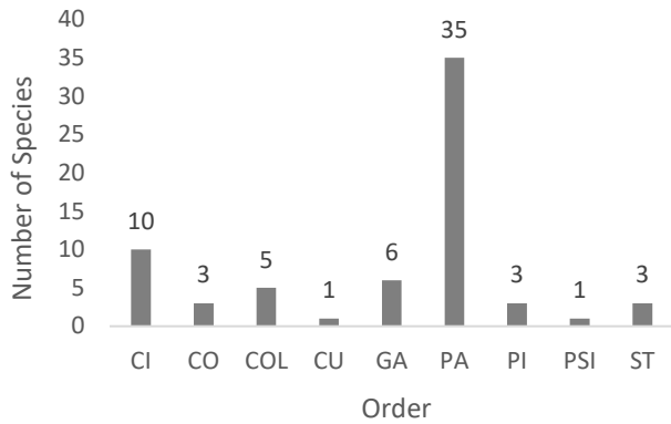
FIG. 2: Number of bird species of different orders. *GA: Galliformes, PI: Piciformes, CO: Coraciiformes, CU: Cuculiformes, PSI: Psittaciformes, ST: Strigiformes, COL: Columbiformes, CI: Ciconiiformes, PA: Passeriformes

During the survey, the main threat observed was illegal hunting for bushmeat, especially of the ground dwelling birds. Use of snares for trapping birds was very high. We also observed many cases of people keeping different species of birds including chukar partridge Alectoris chukar , satyr tragopan, and slaty-headed parakeet Psittacula himalayana as pets.