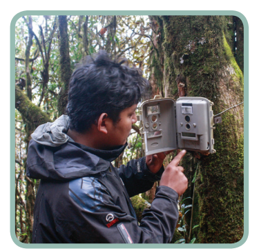
Camera traps being set to study small carnivores.

Previous studies have recorded five other small carnivores: Spotted Linsang, mongoose<sup>1</sup>, Large Indian Civet, otter<sup>1</sup>, and Masked Palm Civet.