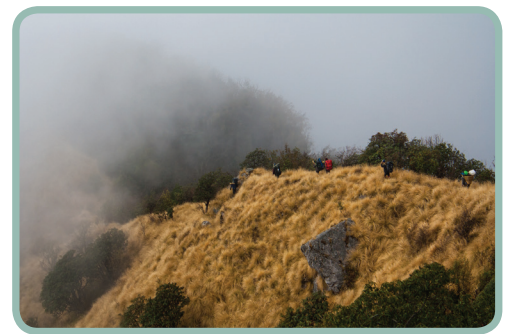
Research team moving to Chitre Pokhari from Gauthale.