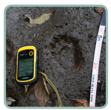
Signs of small carnivores were measured and their locations recorded.