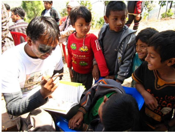
Children and youth of Syaulibazaar enjoyed the face painting session.