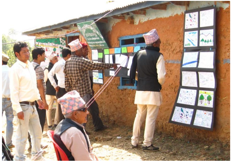
...who immersed in reading the poems and essays on exhibit.