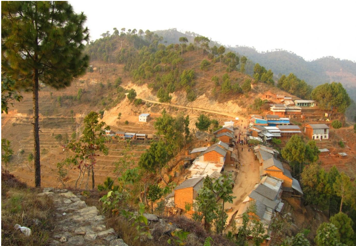
A bird' eye view of Syaulibazaar

The International Owl Festival took place in the Owl Conservation Area of Syaulibazaar, a settlement in Sangkosh Village Development Committee (VDC) of Dhading District. Syaulibazaar is located at 27° 56.781' N / 84° 54.418' E at an altitude of 1193 m, and comprises about 50 households.