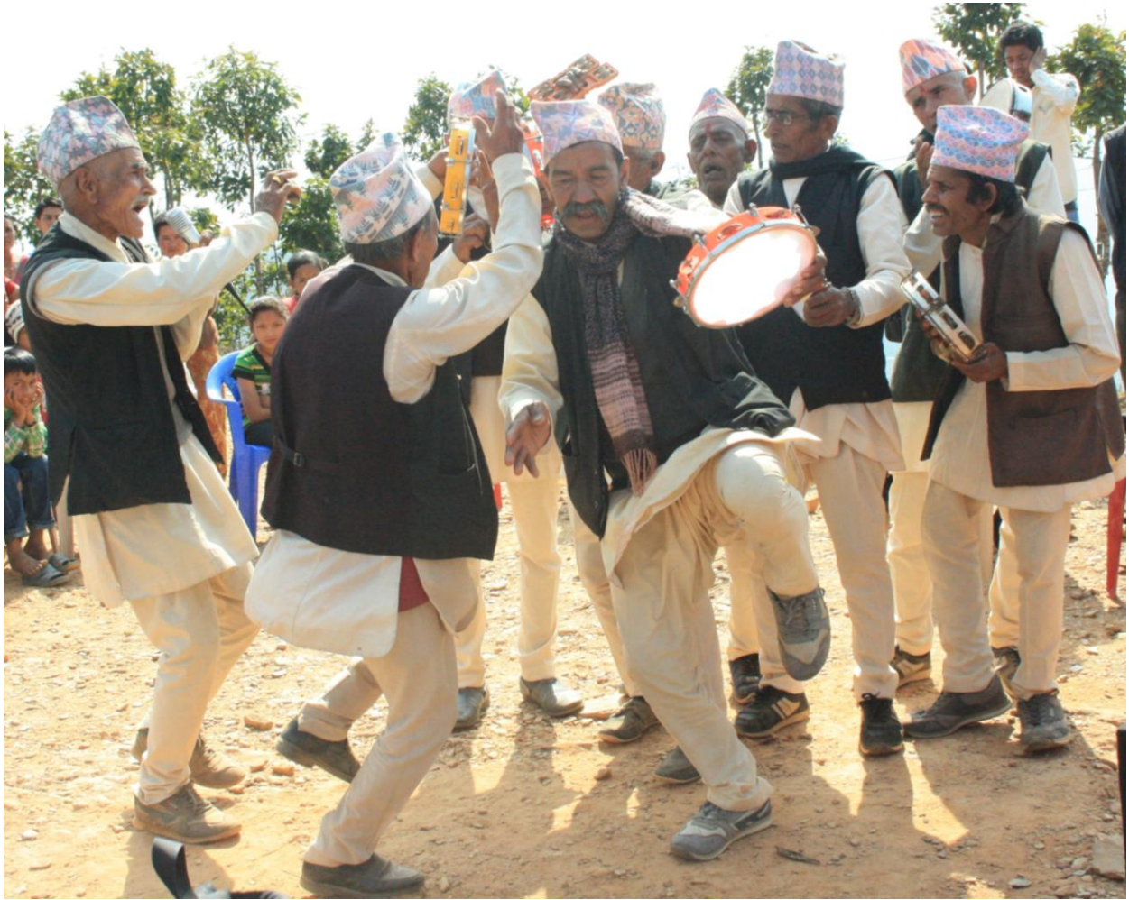
Hariyali Bhajan Samuha , a traditional religious music group from Dhading District, presented a singing and dancing program. Their lyrics are about nature, wildlife and social issues, intended to create awareness for the importance of nature conservation.

In his comic one-act play a boy from Syaulibazaar played the role of a curious village elder asking funny questions about the ongoing International Owl Festival.