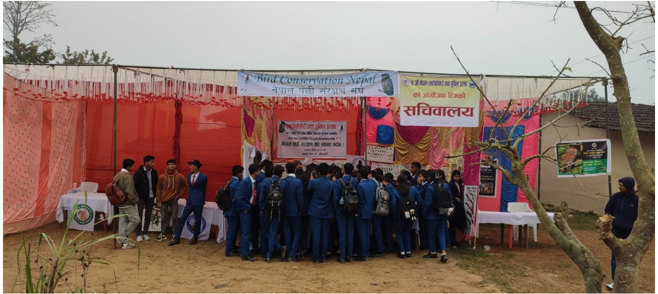
Stall of Bird Conservation Nepal