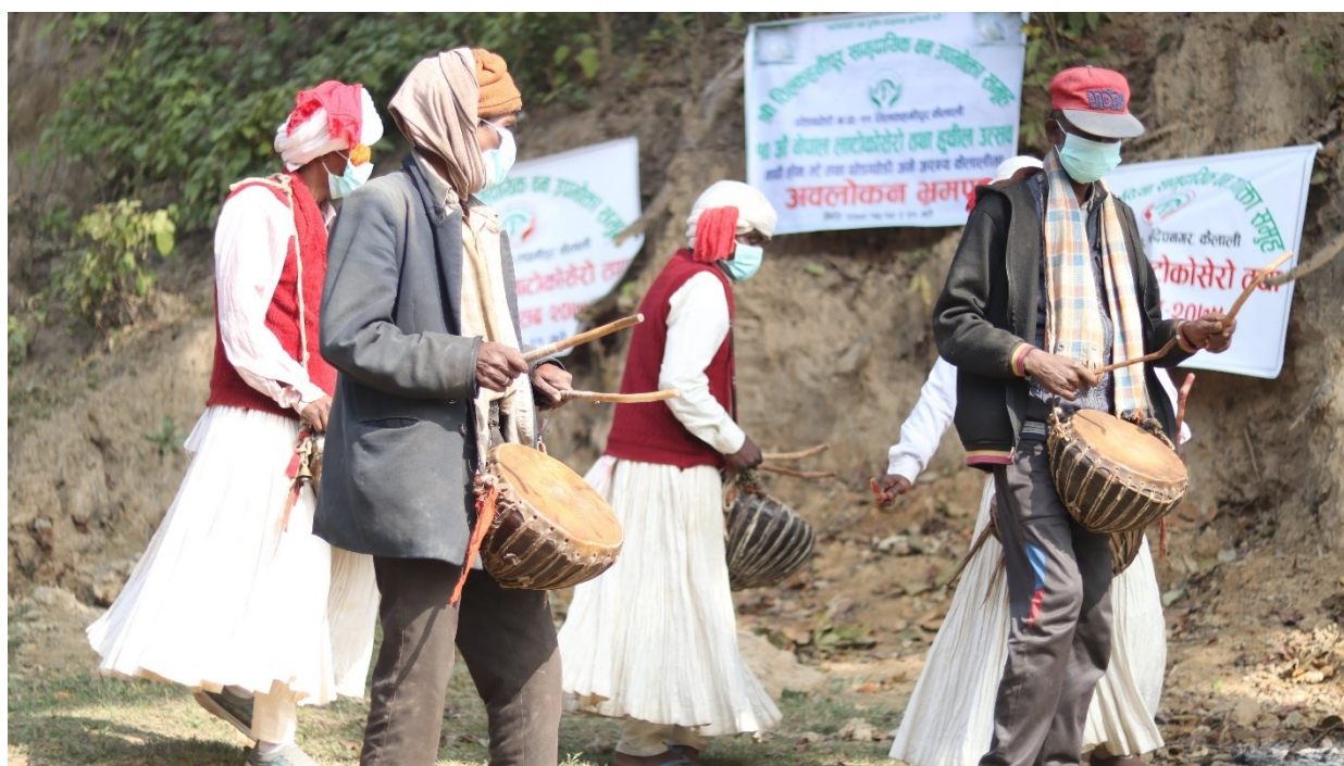
Local people with traditional musical instruments