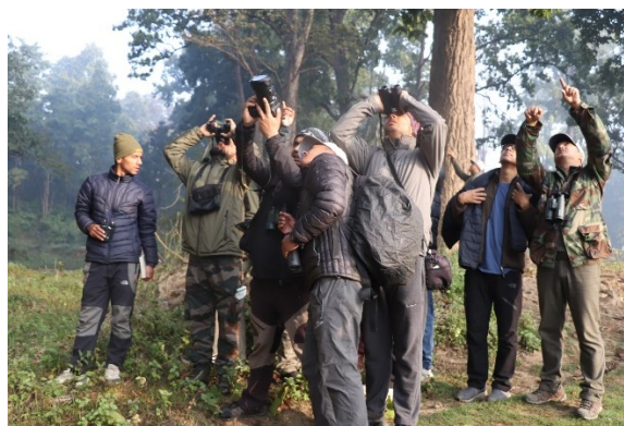
Participants involving in birding