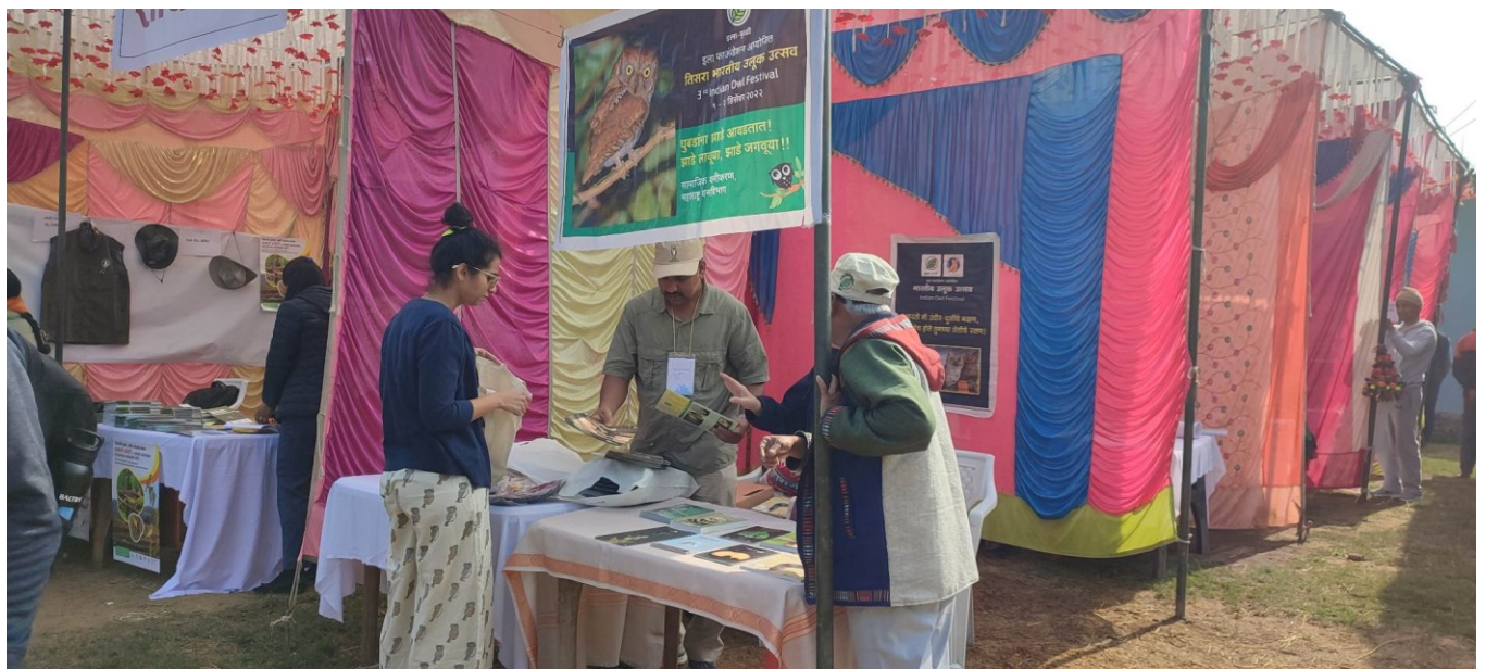
Stall of Ela Foundation from India