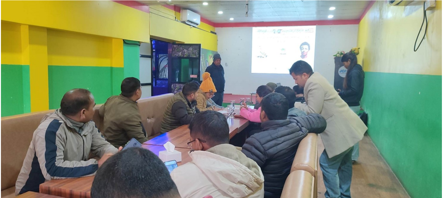
Press conference at Dhangadhi, Kailai