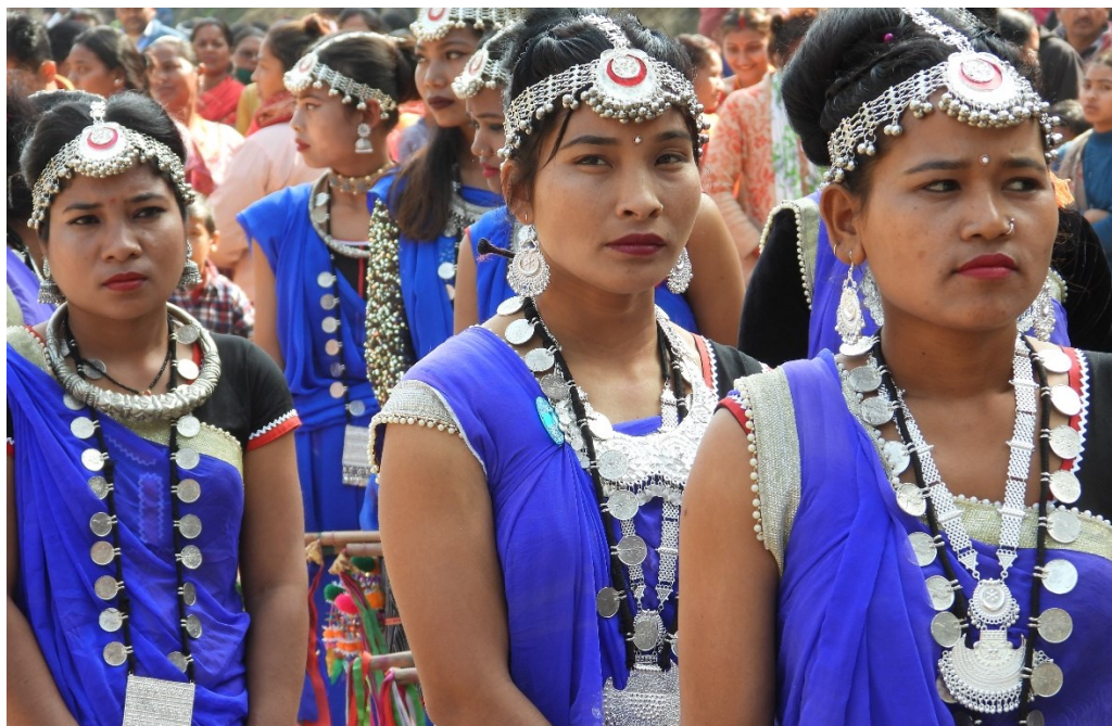
Indigenous cultural programme by a local ethnic group