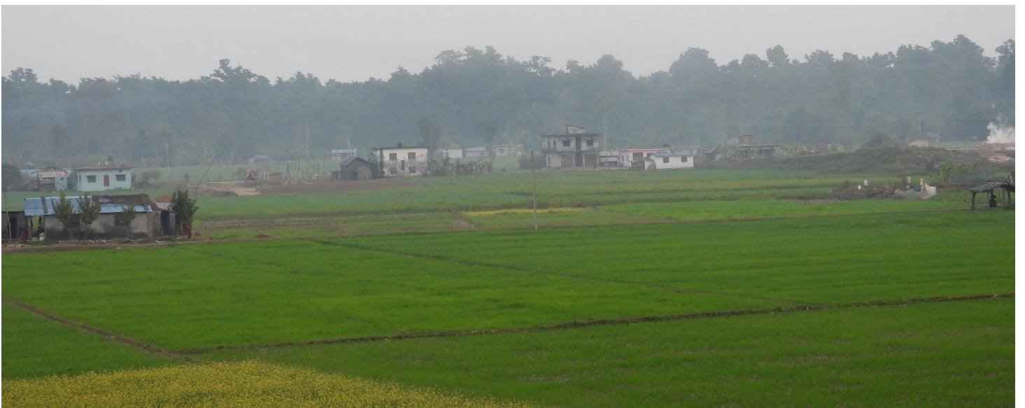
In and around Maghi village, the event site for 'Nepal owl festival'