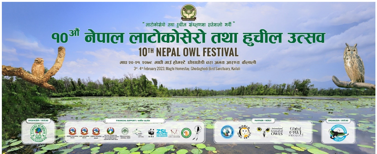
Main banner of NOF 2023