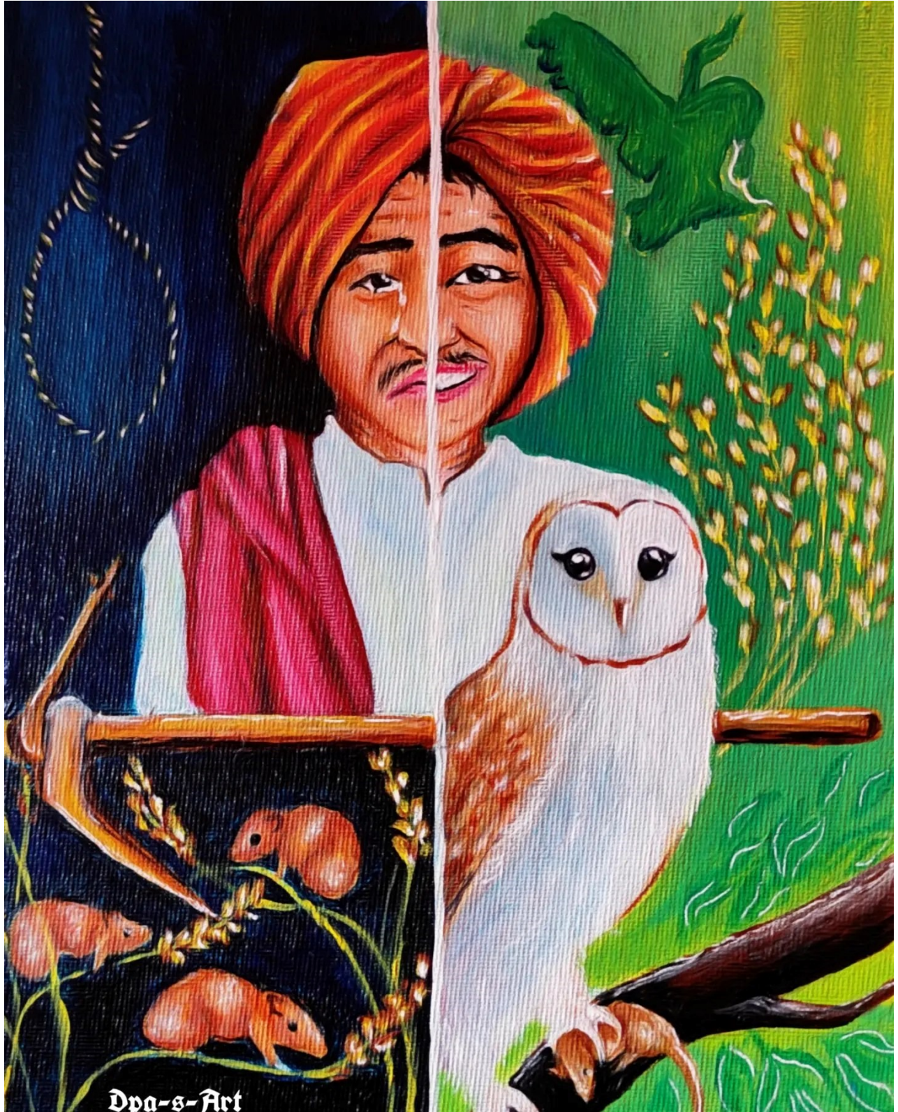
Dya-s-Art (Art by Dipa Gurung)