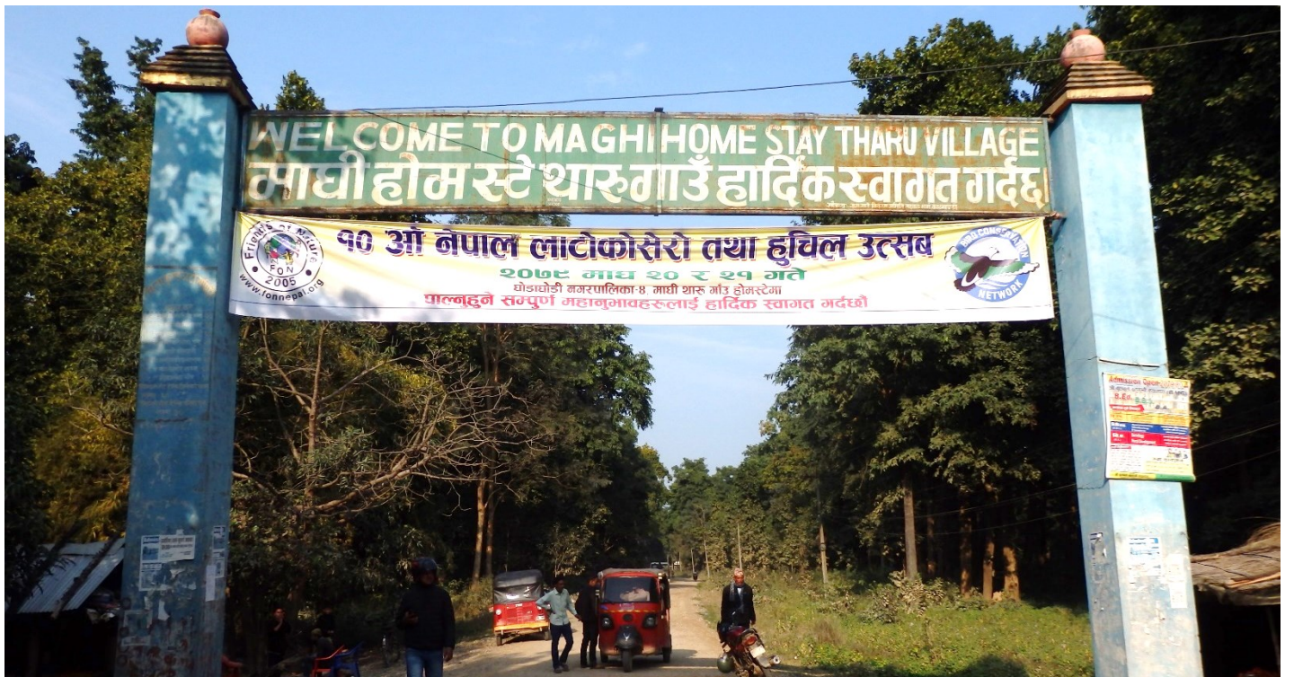
Information displayed at Welcome gate