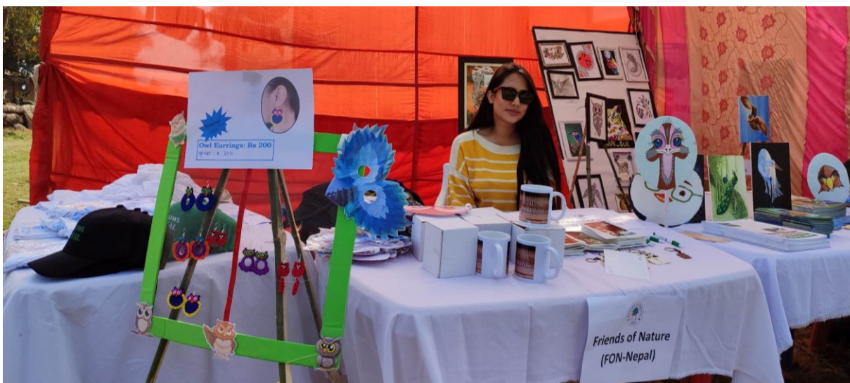
Stall of FON Nepal and Bird Conservation Nepal-Pokhara Branch

Friends of Nature also managed to set up small stall in the festival. Different items related to owl and the festival such as ball pen, masks, cup, keyring, t-shirt, tote bags were displayed and sold. The amount collected from the stall shall contribute to organize next Nepal Owl Festival.