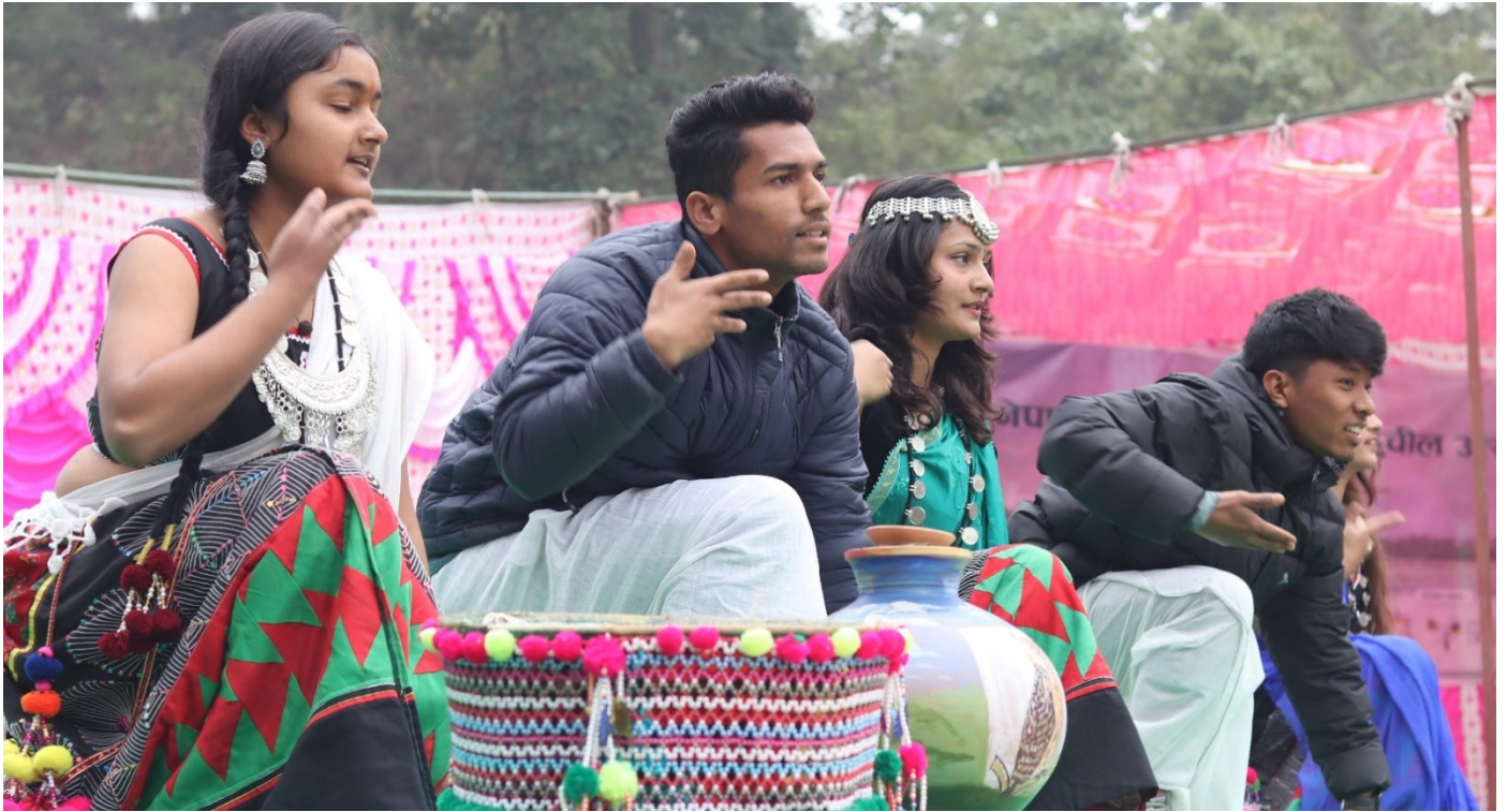
Students of IOF Pokhara performing their dance