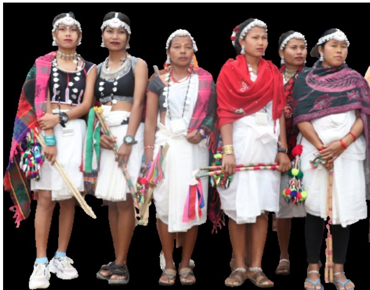
Young girl with their traditional dress