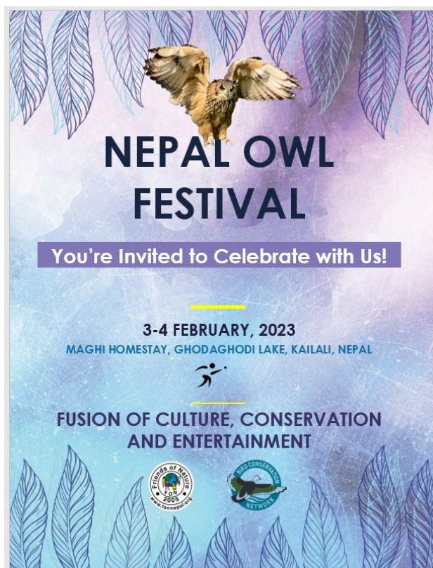
Banners for promotion of NOF 2023 in online social media