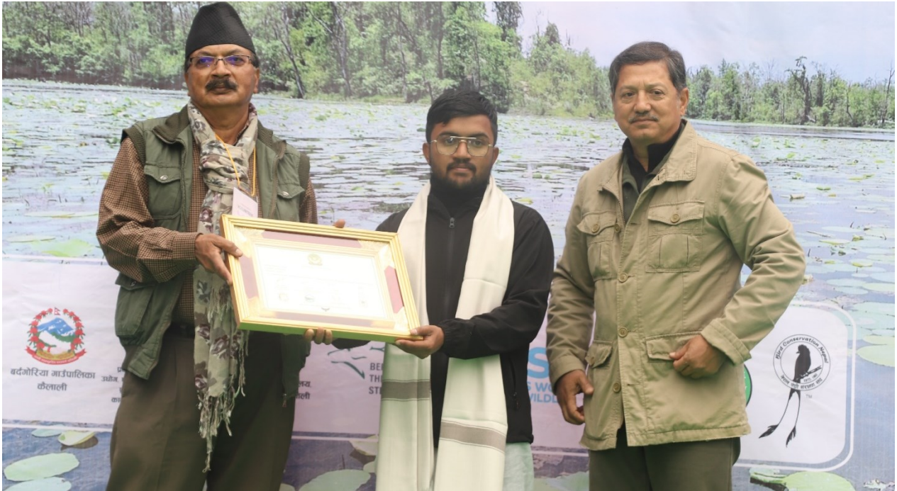
Bird Conservation Nepal- Pokhara Branch