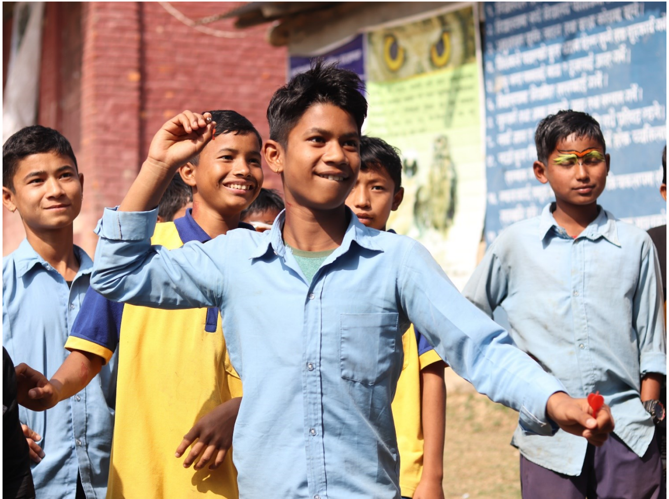
Local students trying to hit the hunter!

Many people were gathered to test their luck and skills for a reward of owl mask, which will make them feel like a winner. Those who hit the owls donate voluntarily to contribute for next owl festival.