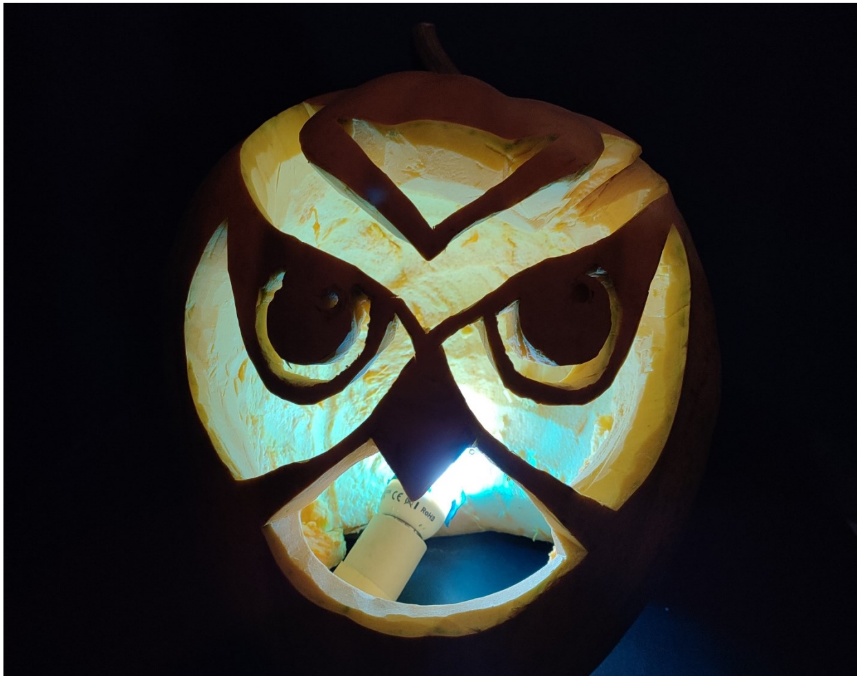
Pumpkin Owl displayed in museum

We are thankful to all the local volunteers, people of Maghi Village and Maghi Homestay for their homely environment, support and participation for making the festival a huge success.