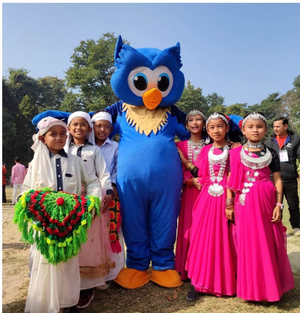
Owl mascot with local children

Calendar was marked for February 3 rd and 4 th 2023, and the venue for tenth Nepal Owl Festival was Maghi Village Homestay, Ghodaghodi Bird Sanctuary, Kailali. The festival is fusion of conservation, local culture, and traditional games. With the main objective of generating awareness among general public, the festival was organized in Nava Prabhat Basic School. The festival was attended by around 5500 local, students, researchers, and conservationists from different countries. The festival was also successful in raising awareness among 1904 students through conservation camps held at their school. Local tradition and culture, cuisines, games, art and crafts were seen to engage lots of visitors and the festival was seen effective to deliver conservation messages and ecological roles of owls.